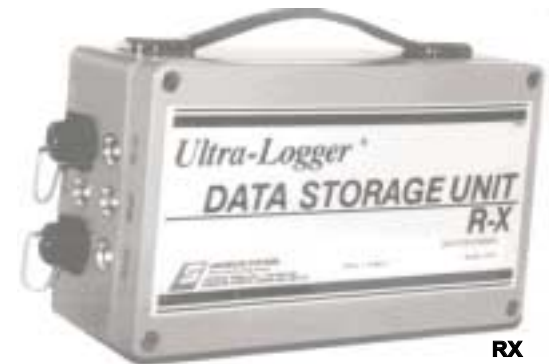
RX 2 TO 16 CHANNEL NEMA 4 DATALOGGER

TSX temperature strings are ideally suited for providing accurate temperature profiles of road beds and pipeline right-of-ways.